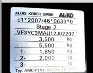
ALKO Chassis VIN Plate